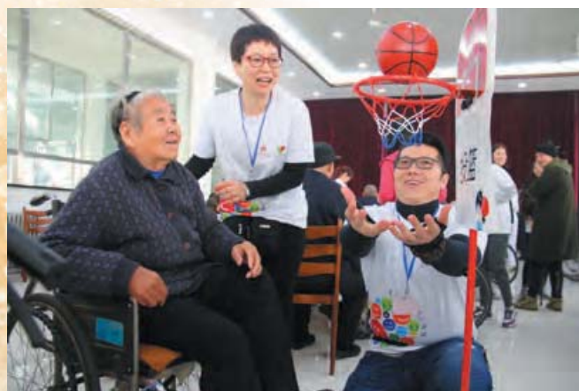
Outbound Volunteering Trip 外展義工活動

本集團員工再次參加英皇慈善基金舉辦每年一度的外展義工活動，加入為期四天的探訪活動，到中國內地河北省為楊受成慈善基金（順平）老年服務中心及楊受成（中國•順平）關愛老年中心提供義工服務。