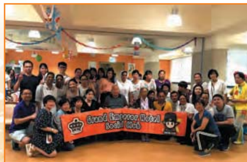
Visit to Elderly Service Centre 長者中心送暖活動