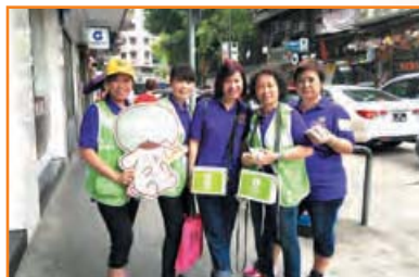
Oxfam Rice Sale Campaign 樂施米義賣