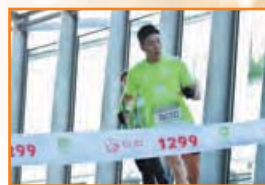
Oxfam Tower Run 樂施競跑旅遊塔